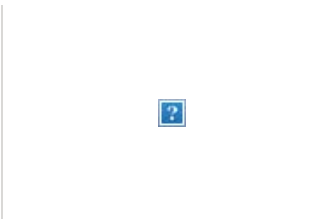
Hardwicks Way, London, SW18 £249,950

A river fronted warehouse apartment offering stunning views of the Thames, Tower Bridge and the City. Read more