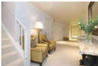
Park Street, London, W1K £3,250,000

A spacious 3 bedroom apartment in this handsome red brick building. Extending to approx 2805 sq ft the accommodation has been recently refurbished by its interior designer owner mixing the best of ... Read more