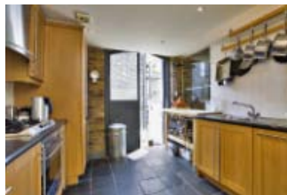
Hope Wharf, 107 Rotherhithe Street, London, SE16 £735,000

An attractively situated two bedroom third floor apartment with views over communal gardens & sole use of a large roof terrace (undemised). Lease expires 25/09/2015. Read more