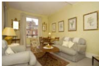
Egerton Gardens, London, SW3 £250,000

A spacious 3 bedroom apartment in this handsome red brick building. Extending to approx 2805 sq ft the accommodation has been recently refurbished by its interior designer owner mixing the best of ... Read more